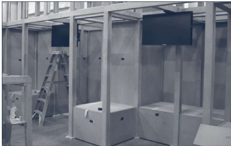
The New South City space will contain stories and images from Greensboro's business, banking and insurance industries

In early March, a Hadley Exhibits team will journey from their 180,000 square foot facility in Buffalo, New York to Greensboro. Upon their arrival, they will unload a fifty foot truck and begin the installation of cases, panels and graphics over a three to four week period. Having